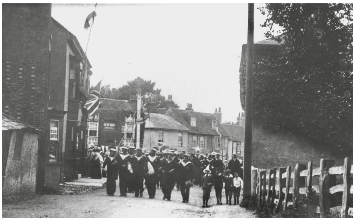
Strolling past the old Tea Room