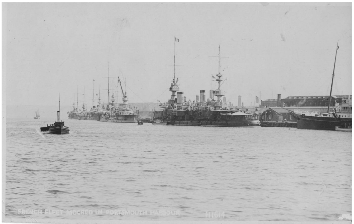
The French Fleet alongside the Portsmouth Dockyard wall