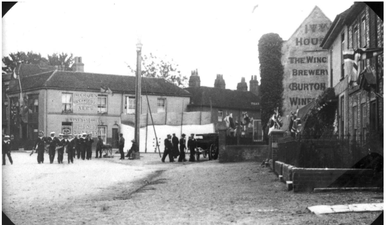
The Crown Inn, Ivy House and Cormorant Public Houses welcomed our visitors