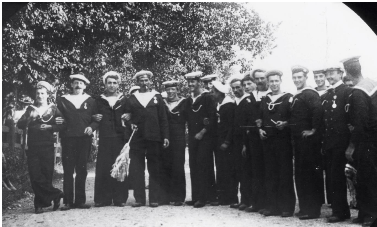
British and French Matelots together