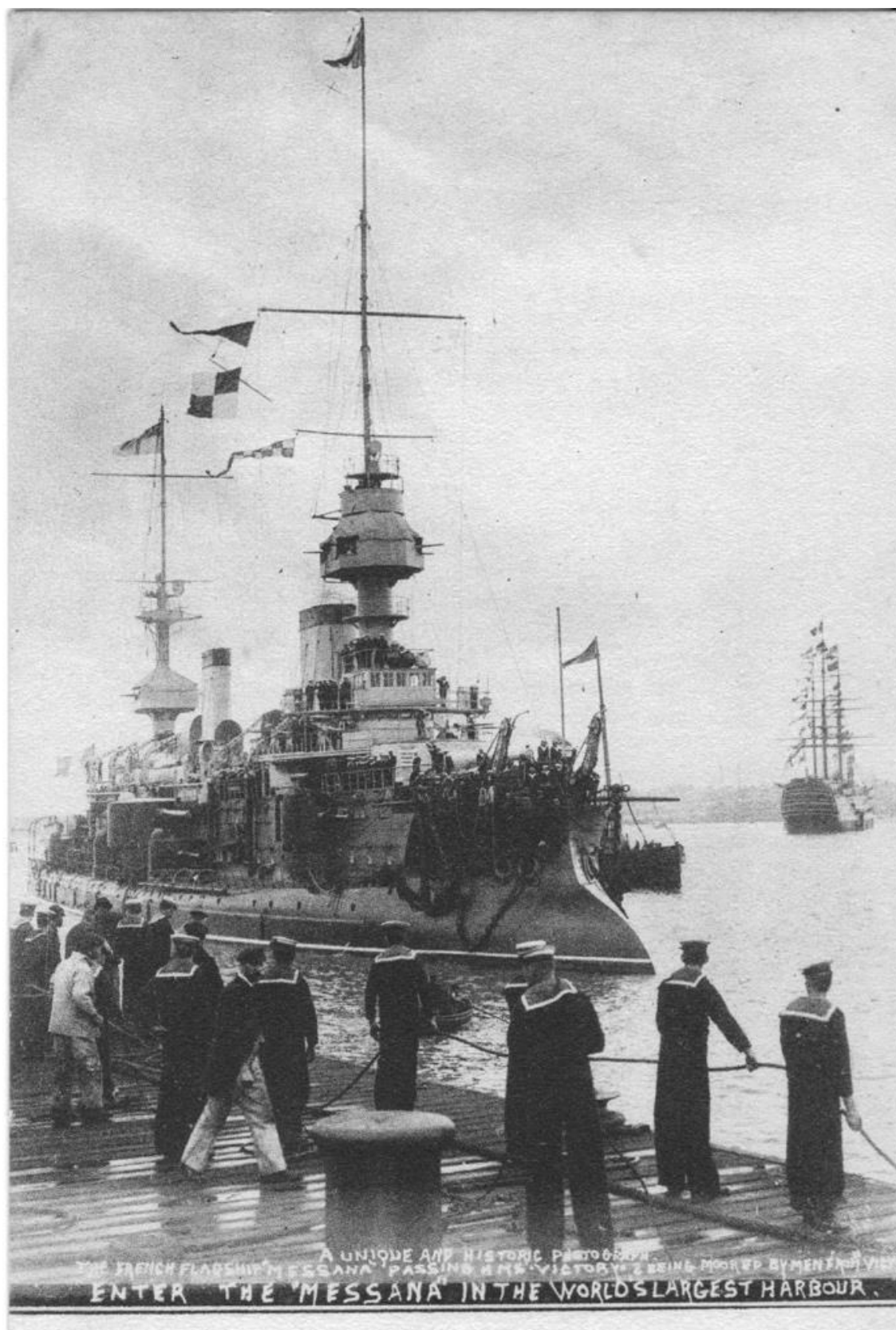
French Flagship Massena coming alongside at Portsmouth Dockyard with HMS Victory afloat off Gosport