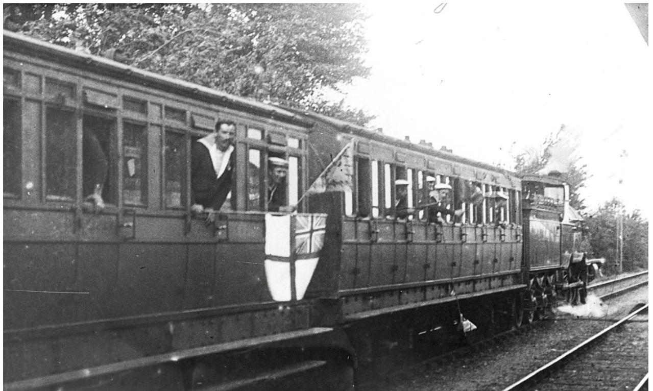
Arriving at Portchester Station